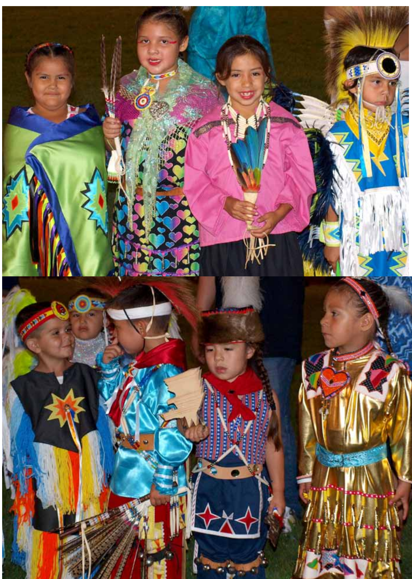
Above are pictures of some of the Tiny Tot Dancers at the 69th Annual Pawnee Homecoming

Our second activity was the annual Tiny Tot Contest held during the Pawnee Indian Veterans Homecoming. The Health Education Program offered physical activity and outside play incentives to the children that participated. We appreciate the Pawnee Indian Veterans Committee for allowing us to help with this event. The Tiny Tots Contest provides the opportunity for children to engage in cultural activity while also being physically active and healthy.