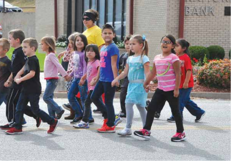
Pawnee Elementary Schools participate in the Annual Walk against Drugs. The students did a great job!