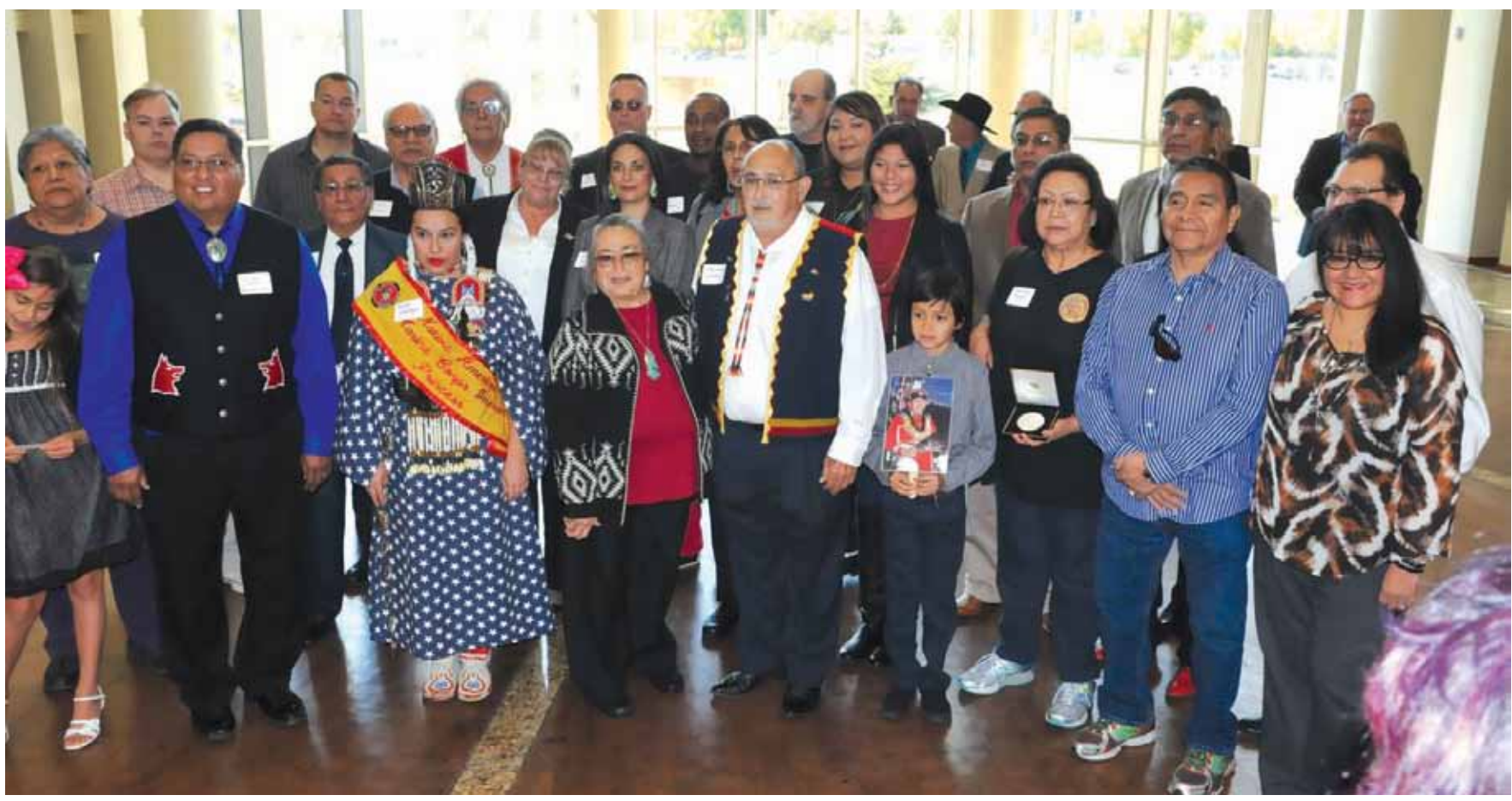
Pictured above are the Attendees at the Oklahoma Military Hall of Fame Press Conference on November 13, 2015