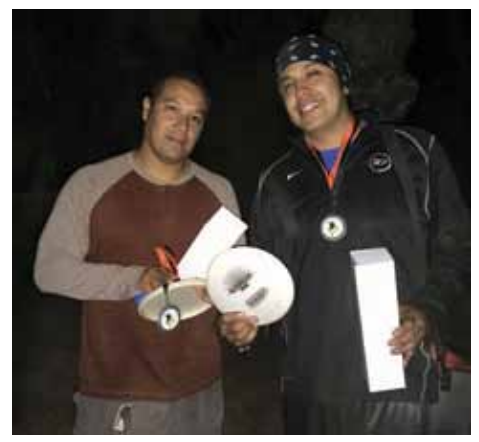
2<sup>nd</sup> place-Sauk Nation