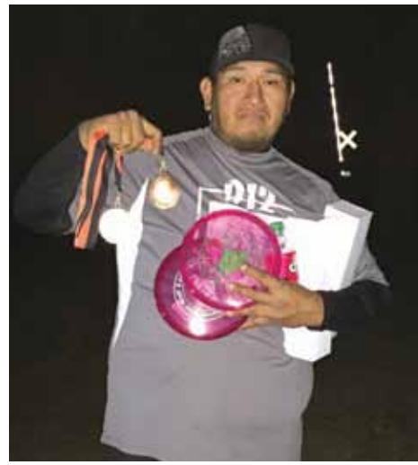
3<sup>rd</sup> place-Chain Gang

For the most up-to-date information about the Pawnee Nation events and meetings, go to the Pawnee Nation Website at: <u>www.</u> <u>pawneenation.org</u> or visit us on Facebook at Pawnee Nation of Oklahoma