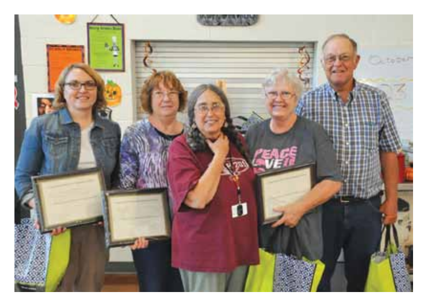
Recently visitors from Nebraska visited Title VI and shared corn and vegetables they had brought down.

#15-79 – A Resolution to request the Bureau of Indian Affairs (BIA) and