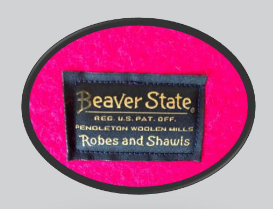
Blanket 5'6" x 6'8"