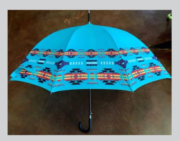
Price: (1) ticket for $2.00 OR (3) tickets for $5.00

Drawing will be held on September 26 at 10:30am