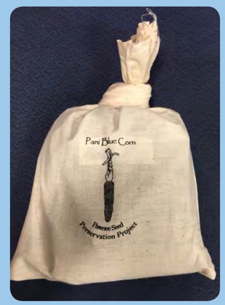
BLUE CORN MEAL IS MEASURED TO 6 CUPS PER BAG.