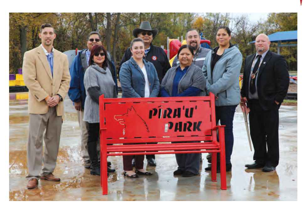
PICTURED ABOVE: Pawnee Business Council, Interium Executive Director, Planning Division, ICDBG Program, and the Pawnee Nation Health and Community Services Division.

November 1st, 2018 at 10:00 a .m., the Pawnee Nation held a Ribbon Cutting ceremony for the Pirau Park Expansion project at the Pawnee Nation playground, Pirau Park. The expansion consists of adding an expanded area with more playground mulch, new playground equipment, full-size basketball court, four horseshoe stations, power pedestals, a water faucet, benches, trashcans, BBQ grill, and a new covered pavilion with seating, allowing more hangout areas in the park.