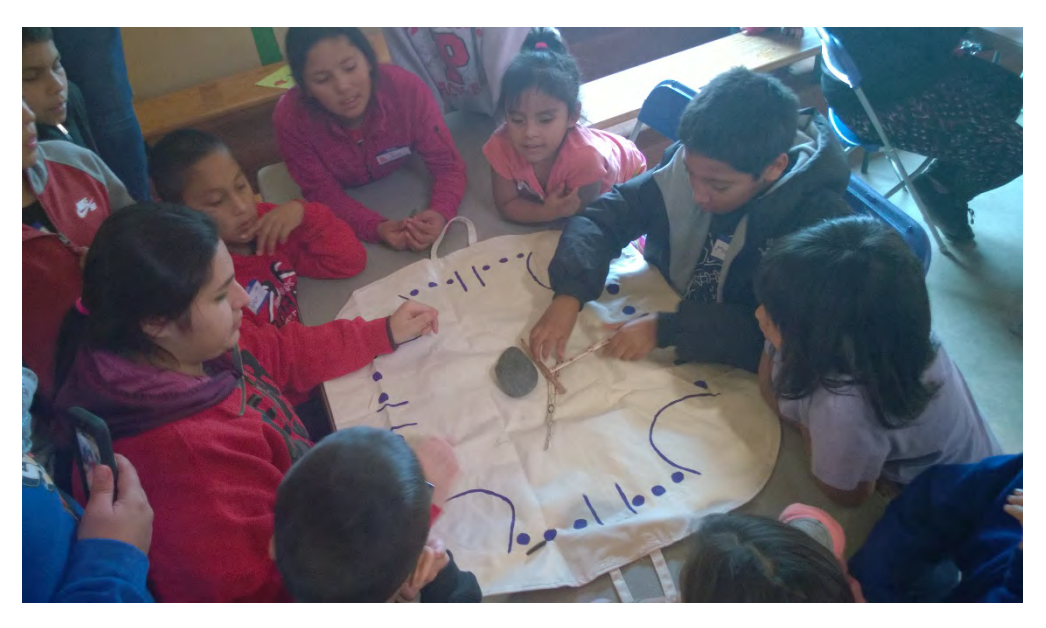
PAWNEE YOUTH LEARNING A PAWNEE GAME DURING WINTER CAMP 2017

For those tribal members who are planning to attend college next year please make note of the following deadlines: