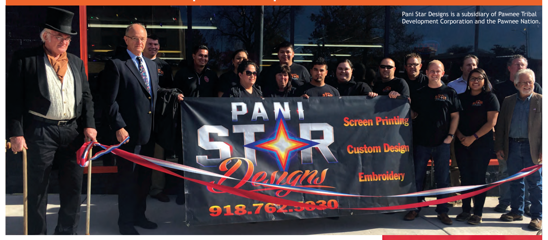
Pani Star Designs, is a screen printing shop that has both a retail storefront, custom designs, and can print in bulk orders of Apparel.

On November 28th, a Ribbon Cutting event was held at Pani Star Designs to kick off Grand Opening festivities for the retail business. Visit our store located at 530 5<sup>th</sup> Street in downtown Pawnee.