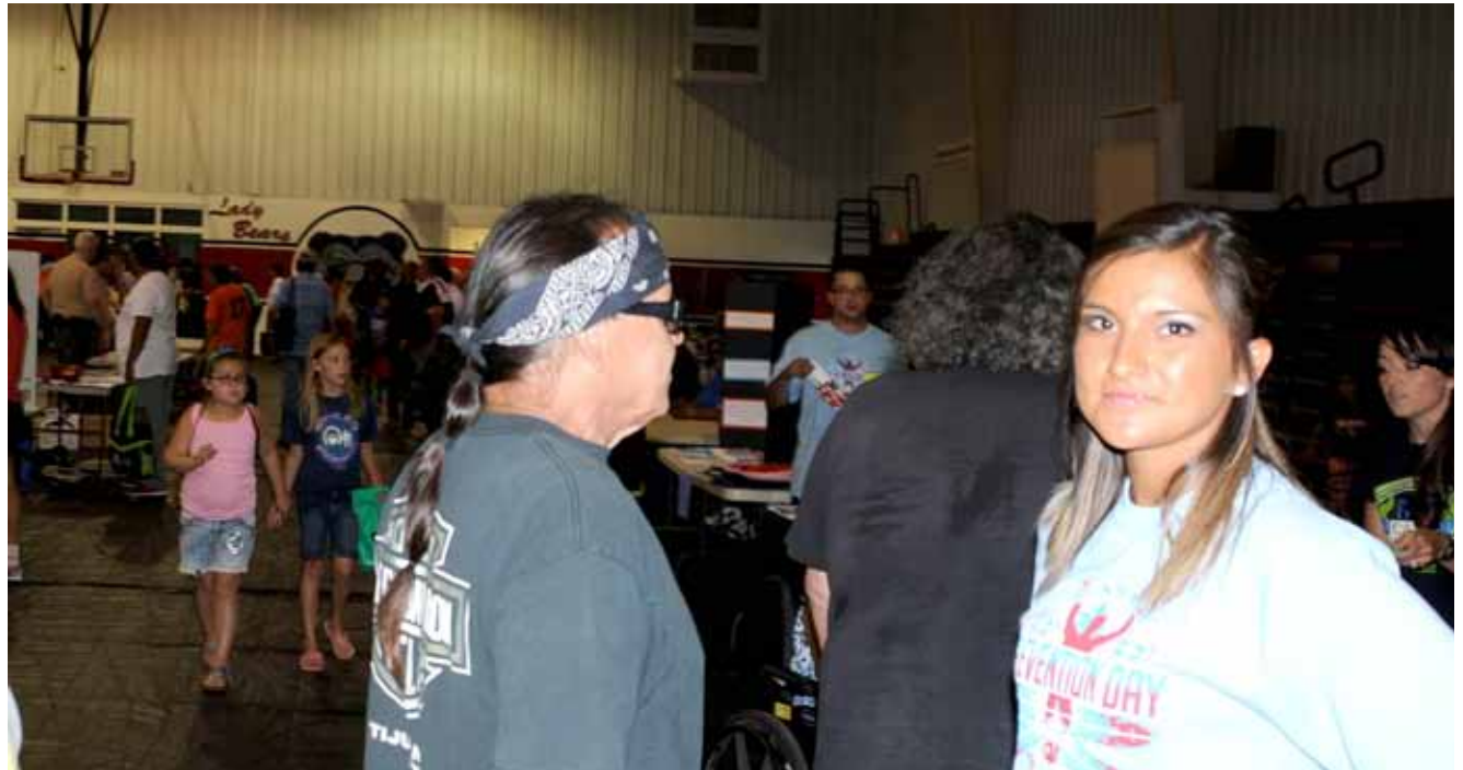
Health Fair Participants at the Pawnee Nation Gym