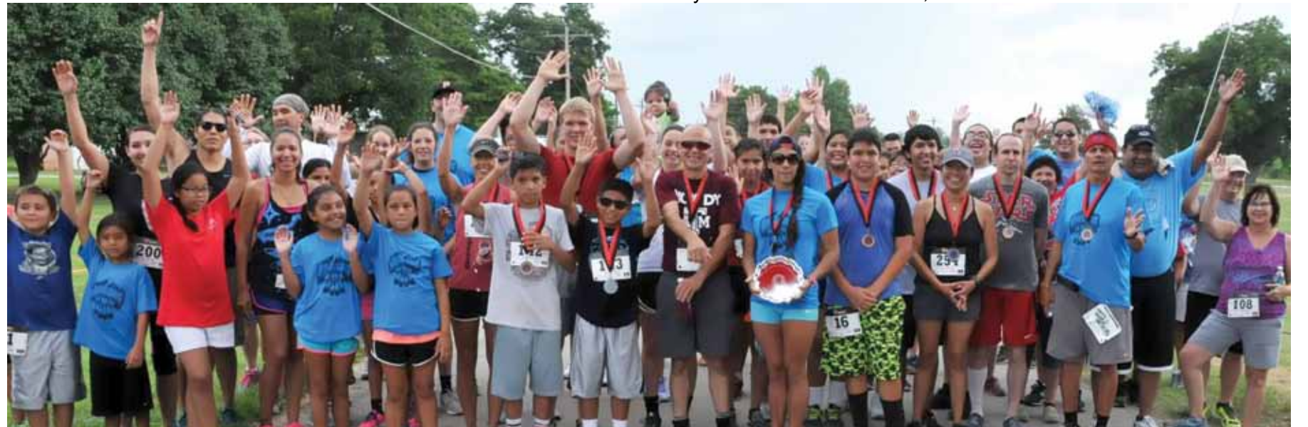
The Pawnee Nation Diabetes Program's coordinated the 34th annual Hawk Chief 5k run/walk held on Sunday, July 5, 2015. 160 runners participated in the event. The course began and ended near the gate on the northwest side of Memorial Field. The 5k course was comprised of a route to downtown Pawnee, around the Square, east on Harrison Street to the Trading Post, north to Beck Drive, west to stadium road and finally south to the finish line.