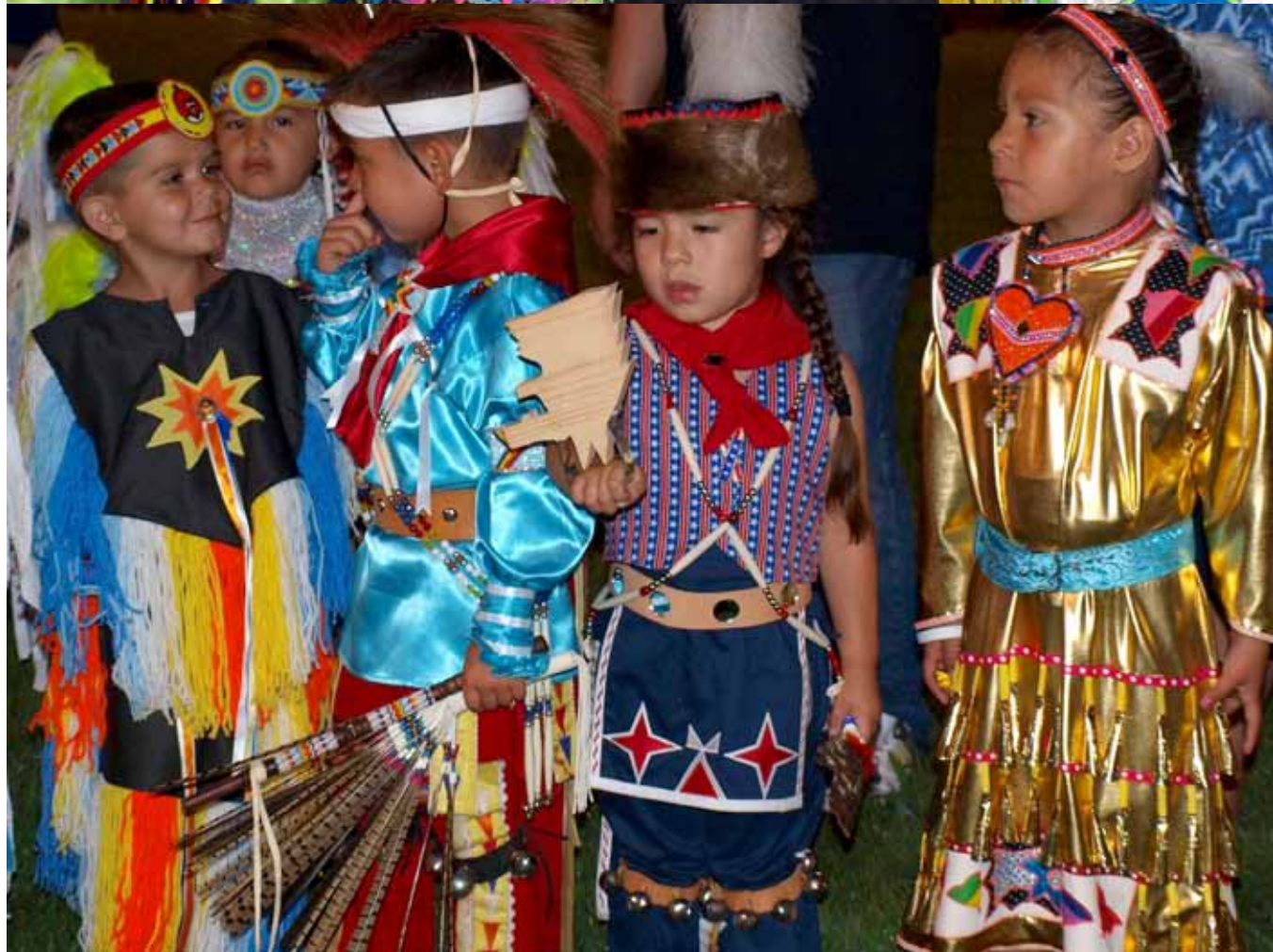
Above are pictures of some of the Tiny Tot Dancers at the 69th Annual Pawnee Homecoming

The Annual Hawk Chief Run (see pictures on page five) wrapped up the homecoming festivities this year. The CHR Program in collaboration with Pawnee Pride helped with timing of this year's run. Thank you to the participants and organizers for allowing the CHR Program to participate.