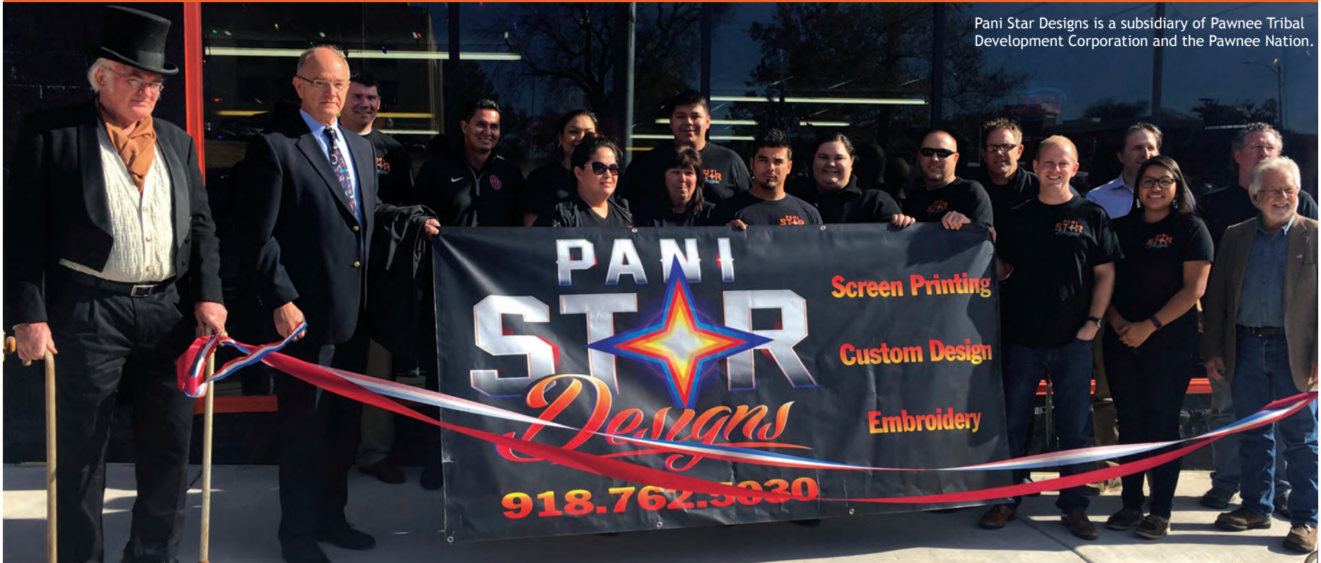
Pani Star Designs is a subsidiary of Pawnee Tribal Development Corporation and the Pawnee Nation.

Pani Star Designs, is a screen printing shop that has both a retail storefront, custom designs, and can print in bulk orders of Apparel.