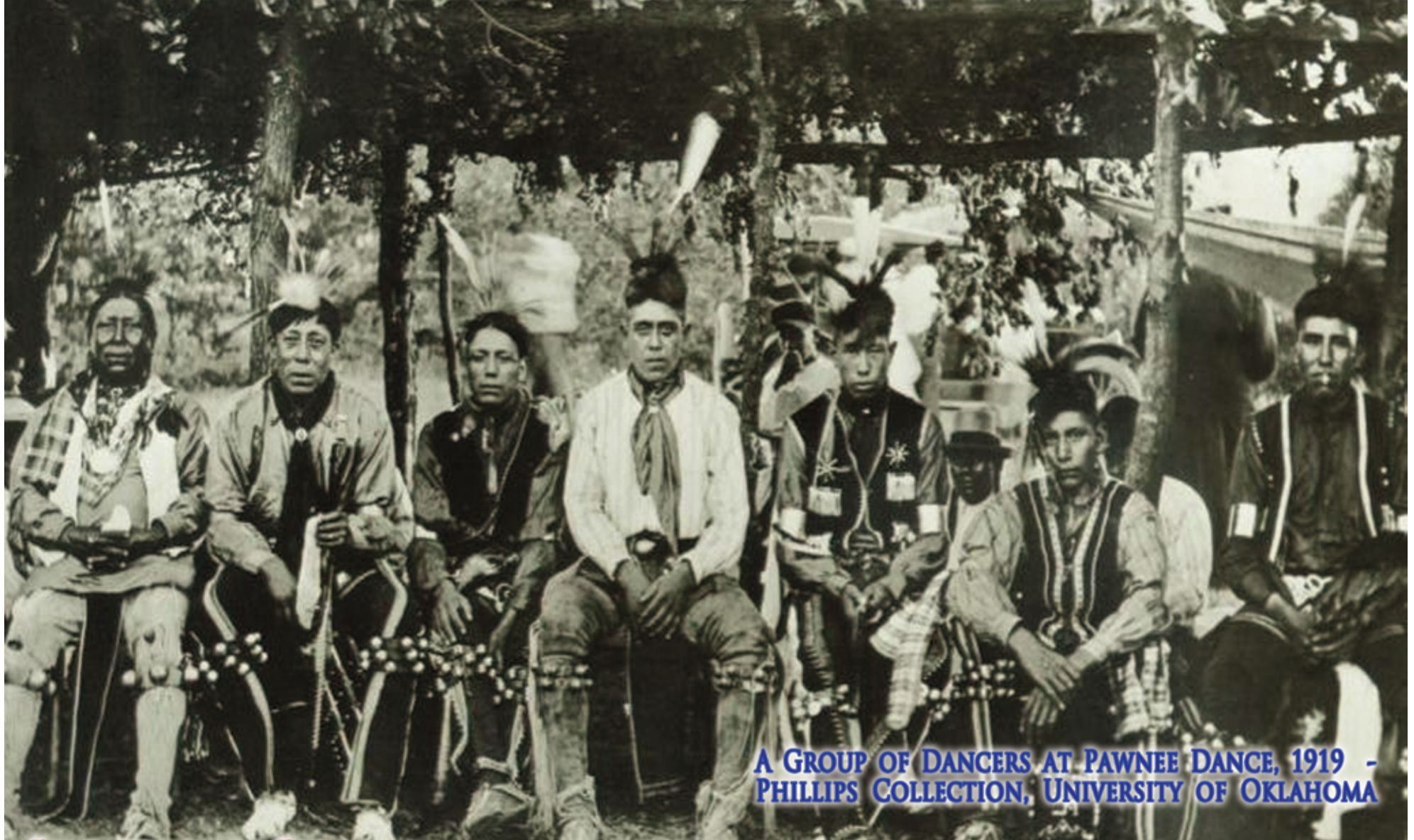
A GROUP OF DANCERS AT PAWNEE DANCE, 1919